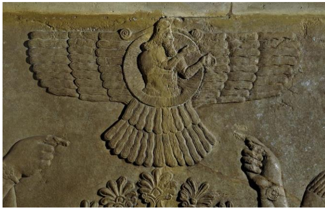
Assur in symbolic representation

https://www.livius.org/sources/content/cyrus-cylinder/ https://www.livius.org/sources/content/mesopotamian-chronicles-content/abc-7-nabonidus-chronicle/ https://www.livius.org/pictures/a/tablets/abc-07-nabonidus-chronicle-obverse/ https://rambambashi.wordpress.com/2009/01/21/an-important-source-from-babylon-the-nabonidus-chronicle-abc-7/ http://www.etana.org/node/6612 https://www.ancient.eu/Cyrus_the_Great/ https://en.wikipedia.org/wiki/Fall_of_Babylon https://en.wikipedia.org/wiki/Cyrus_Cylinder https://en.wikipedia.org/wiki/Nabonidus_Chronicle