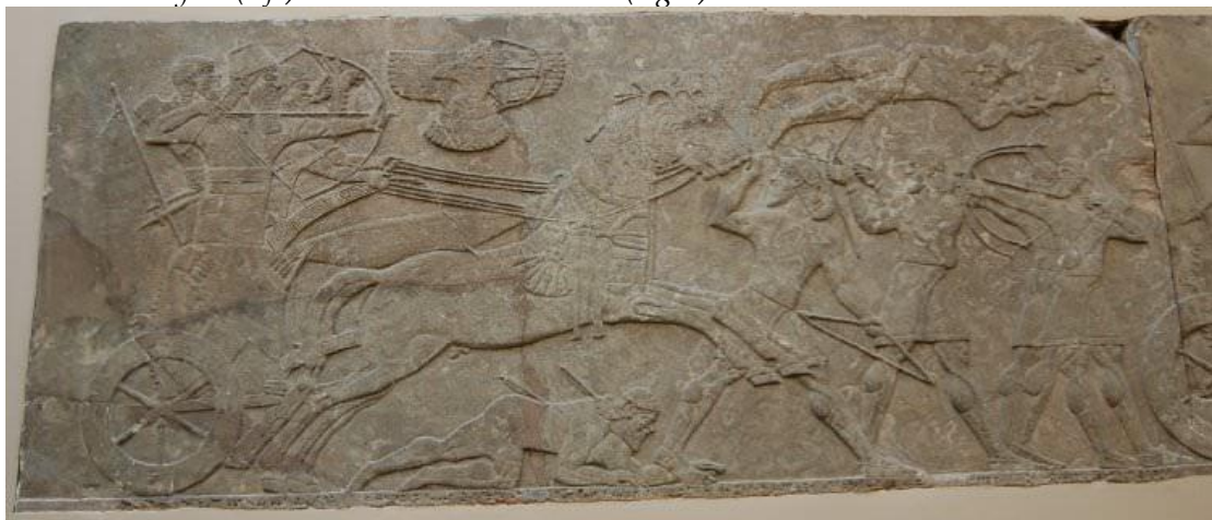
Ashurnasirpal II is hunting under the auspices of Ashur