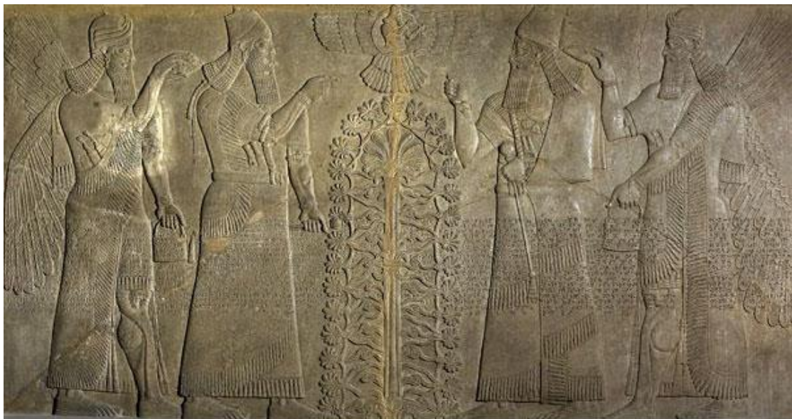
Epiphany of the only God Ashur (Assur) above the Tree of Life, next to it the Assyrian emperor Ashurnasirpal II (883-858 BCE), represented twice, officiates as emperor and as high priest, under the blessing of Assur. From the throne room of Kalhu (modern Nimrud in North Iraq), capital of Ashurnasirpal II

Of course, despite the evident Assyrian spiritual, intellectual, cultural and artistic impact, Zoroastrian monotheism is an original religious phenomenon and all the therein incorporated Assyrian monotheistic concepts were stated in purely Iranian terms and codes, symbols, connotations and forms. But this fact triggers two very simple questions: