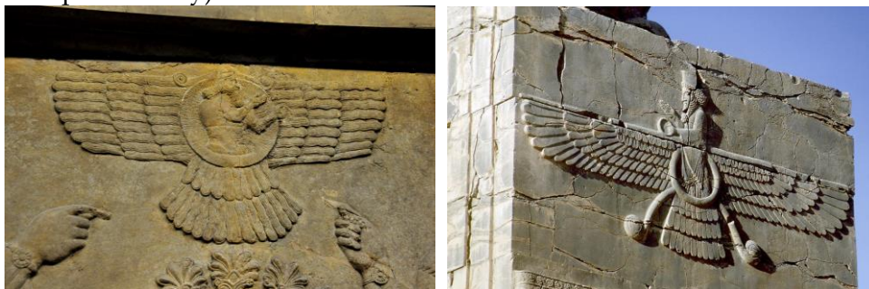
Assur in Assyria (left) & Ahura Mazda in Iran (right)

Due to the lack of textual evidence antedating the establishment of the Iranian monarchy by Cyrus the Great, it is difficult to respond straightforwardly to these questions. Old Achaemenid cuneiform seems to have been invented by Assyrian imperial scribes only few decades prior to the establishment of the Iranian monarchy; the Iranian imperial scribes were indeed well-educated in Sargonid Nineveh at the time of Assurbanipal (669-625 BCE); that's why they were also perfectly acquainted with, and very well versed into, Assyrian-Babylonian, Elamite, and (to some extent) Sumerian languages and cuneiform writings (Sumerian was already a dead language for 1500 years before the early Achaemenids; so to them it was like Latin to Western Europeans today).