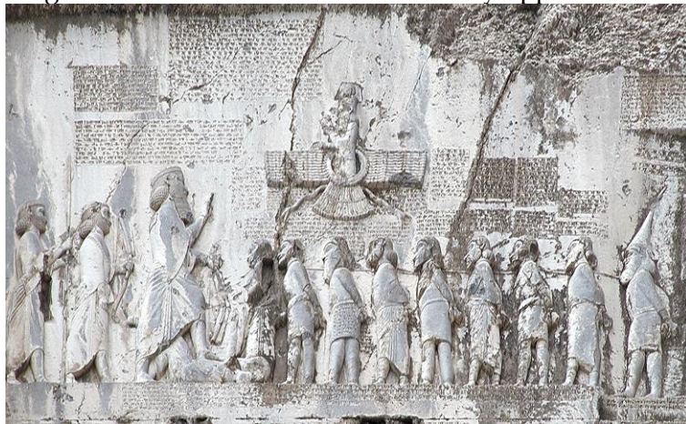
Behistun Inscription and relief, near Hamadan (Ecbatana, NW Iran): Darius I the Great steps on the body of the impostor Gaumata; the conspiracy against the Achaemenid court and

In this regard, we can find a very good example in the well-known case of turmoil that took place at the end of the reign of Kabujiya / Cambyses: the end of the great emperor, who invaded Egypt, Libya and the Sudan (i.e. Cush / Ancient Ethiopia), the pernicious attempt of the Magi to obtain imperial and spiritual power by helping the preposterous impostor Gaumata to usurp the throne, the ensuing chaotic situation, and the final prevalence of Darius I the Great testify to a formidable religious clash between two diametrically opposed and antagonistic priesthoods.