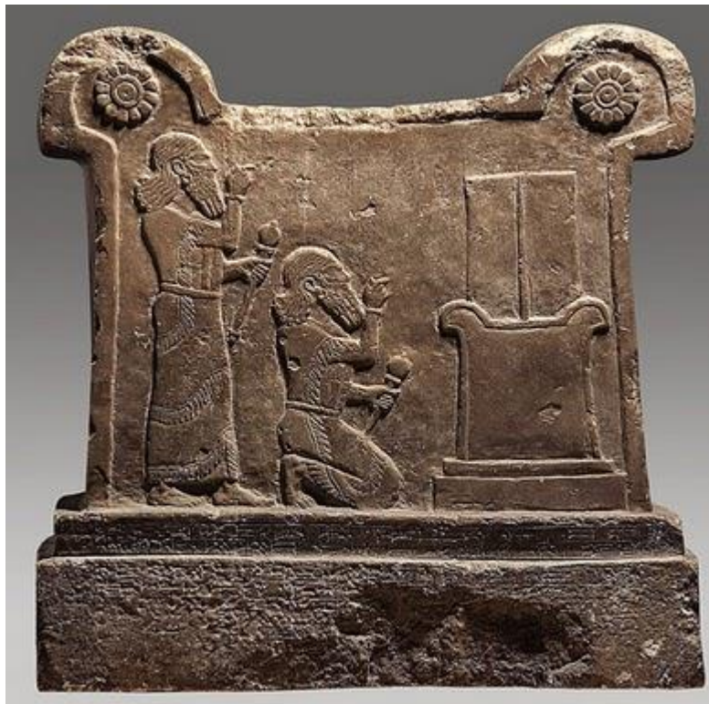
The first film (movie) in the History of Mankind; the monotheistic Assyrian Emperor Tukulti Ninurta I (1244-1207 BCE) is portrayed twice, standing and then kneeling, in front of the aniconic representation of God as baetylus (betyl, i.e. a meteorite). From the Temple of Ishtar at Assur (Assyria), Iraq; nowadays in Pergamon Museum, Berlin, Germany

Actually, what had happened with the Iranian conquest of Babylonia was that the millennia-long Assyrian monotheistic-Babylonian polytheistic controversy, which had caused a myriad of wars in Mesopotamia and throughout the Orient before the rise of Cyrus the Great, found other means of expression, being reproduced among other nations. In fact, the Mesopotamian spiritual-religious confrontation was simply transplanted within Achaemenid Iran. It was not a matter of mere coincidence that the Achaemenids appeared as the spiritual, intellectual and cultural offspring of Sargonid Nineveh; it was a normal consequence of the fact that Zoroaster had lived in monotheistic Nineveh, was educated there, was initiated into the Assyrian imperial universalism, and later tried to transfer the doctrine among Iranians.