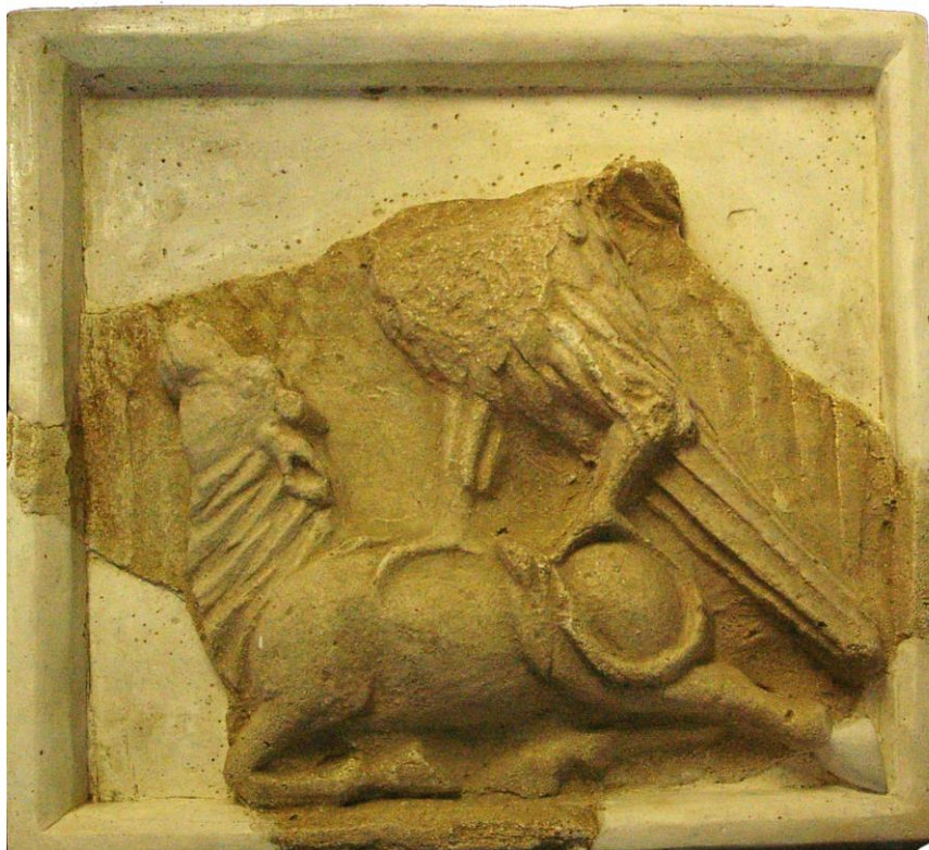
Parthian relief from Zahhak Castle in East Azerbaijan province, Iran: a bird (possibly eagle) stands on the back of a ball. This may be the very original mythical narrative and form of Mithraic tauroctony.

https://en.wikipedia.org/wiki/Tauroctony