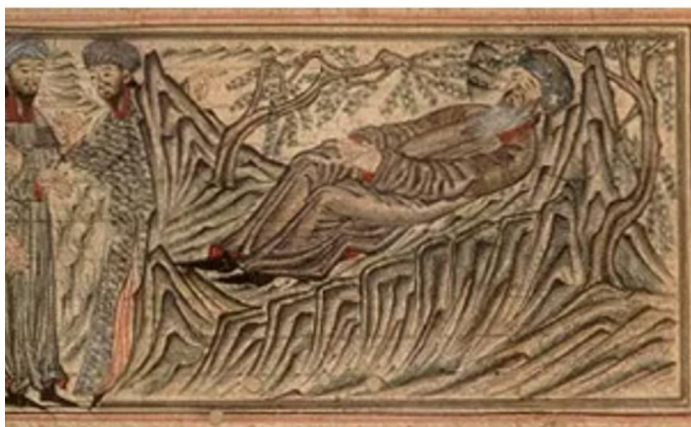
Prophet Muhammad on his death bed (Jami' al-Tawarikh)