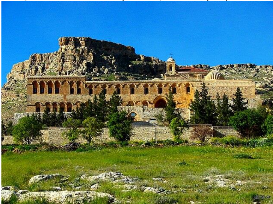
Deyrulzafaran (or Derzafaran; 'the Saffron Monastery) is mainly known as Mor Hananyo Monastery, being located 5 km from Mardin (SE Turkey) in the famous Tur Abdin region,