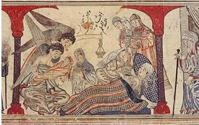
The birth of prophet Muhammad in presence of humans and angels; miniature illustration on vellum from Rashid al-Din Hamadani's famous masterpiece Jami' al-Tawarikh (lit. 'Compendium of Chronicles'), which is also known as 'Universal History' (Tabriz-Iran, 1307)

However, there is even more to it, if one examines the fundamentals of the divine revelation as spelled out in Islam's holy text and the associated explanations. The historical reality is that Muhammad, either one accepts him as prophet or not, never pretended that he was preaching a 'new' religion; according to his revelation (the Quran) and explanations (the Hadith), Islam (lit. 'submission to God') was the only true faith ('religion') of Adam. In fact, according to the prophet Muhammad's world conceptualization, there has been only one religion in the History of Mankind; it was preached by various prophets, either they were/are known to humans as such or not. All prophets were sent by God to correct deviations, because beyond the only and true religion (which involves total devotion to God), there have been across the ages numerous deformations, distortions, deliberate alterations, and pernicious modifications of the true religion, and of the preaching / revelation of the various earlier prophets.