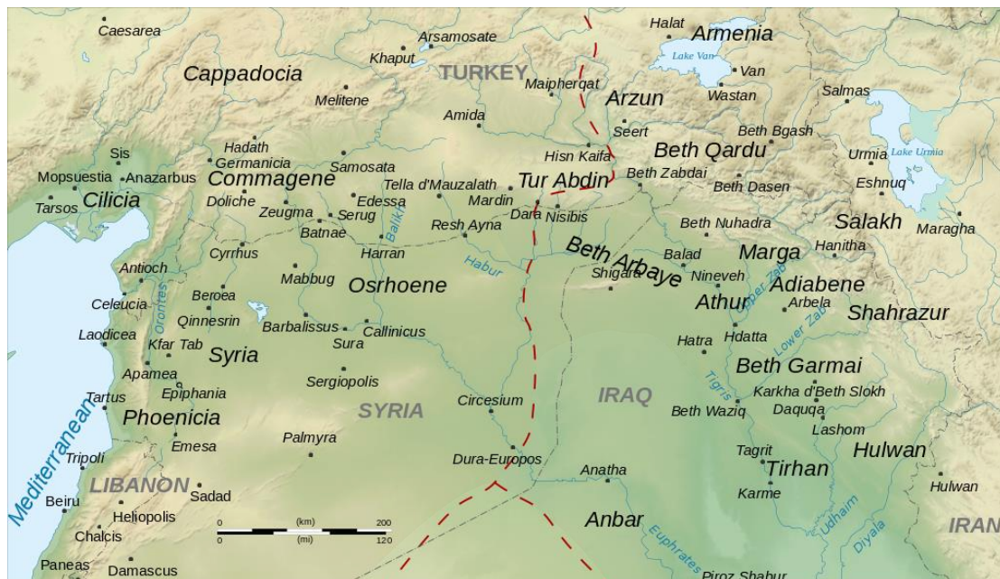
Major centers of Aramaean Syriac Jacobite (Monophysitic/Miaphysitic) Christianity in 7th c. CE Syria and Mesopotamia

But there is certainly more to it. First, among the Islamic armies' soldiers, who advanced after 640 either in the direction of the Iranian plateau and Caucasus or toward Egypt, the Arabs constituted already the minority. Most of the soldiers of the Islamic armies after 640 were Yemenite, Aramaean, and Axumite converts and, speaking about the Islamic armies two decades later (after 661), one has to add also new Turanian and Egyptian converts.