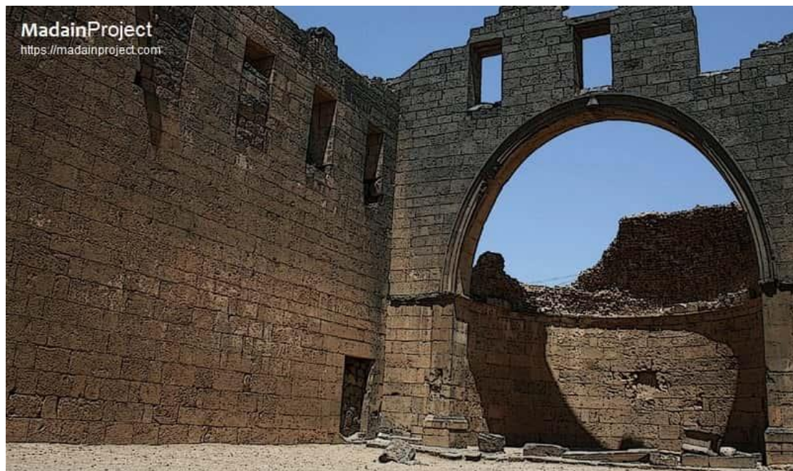
Bosra (South Syria), Bahira Monastery

The book is written for the general readership with the intention to briefly highlight numerous distortions made by the racist, colonial academics of Western Europe and North America only with the help of absurd conceptualization and preposterous contextualization.