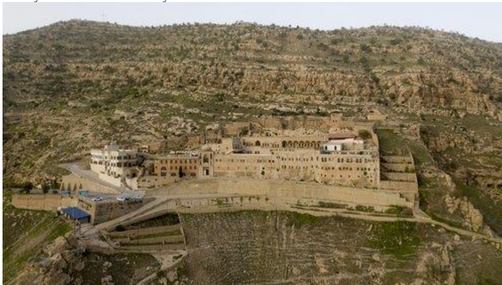
Founded by Mor Mattai the Hermit in 363 CE, Mor Mattai Monastery is situated 20 km north of Mosul and consists in a major center of Aramaean Syriac Jacobite culture and faith.

This barbarism took an end with the preaching of Prophet Muhammad, who transferred Aramaean culture, education, intellectuality and spirituality among the Arabs. All the themes and topics discussed by Prophet Muhammad, either in his revelations (Quran) or in his explanations (Hadith), were Aramaean. Of course, and with reference to developments taking place during the middle of the 7th c., there was an evident differentiation between a) Christian Aramaeans and b) Muslim Aramaeans and Muslim Arabs; but the differentiation was only religious, and not cultural. Culturally, the groups a) and b) were identical; and religiously they differed only partly and not fundamentally. But the perfidious colonial Orientalists have always been intentionally oblivious of this fact.