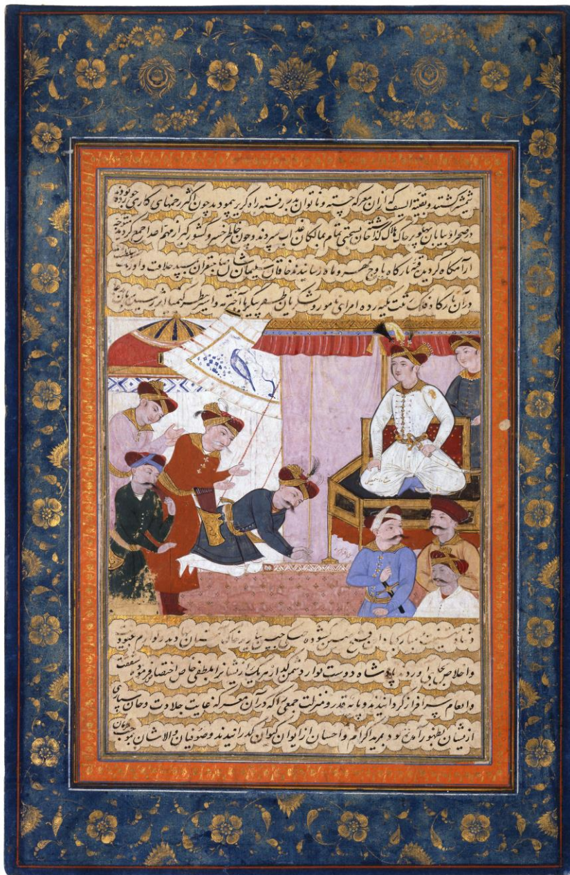
Miniature created by Mo'en Mosavver: Shah Ismail I holds an audience and welcomes the Qizilbash after they defeated the Shiroanshah Farrukh Yasar; album leaf from a copy of Bijan's Tarikh-i Jahangusha-yi Khaqan Sahibqiran (A History of Shah Ismail I), produced in Isfahan, end of the 1680s