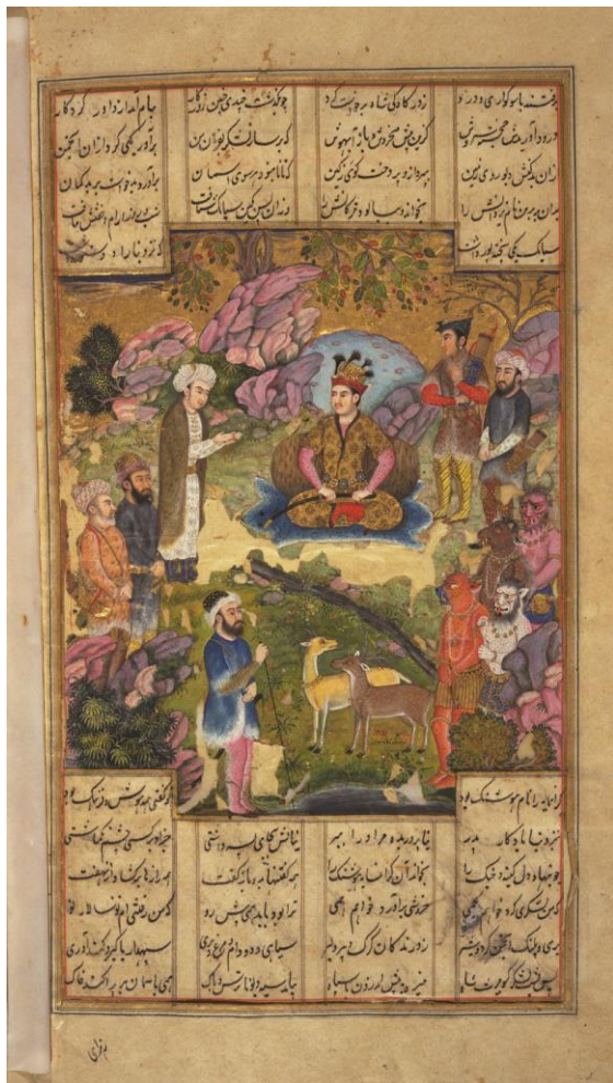
Keyumars instructs his officers to combat Ahriman: this is how the preaching of all the prophets is encapsulated in one symbolic representation. Spirituality does not need volumes of otherwise useless treatises to set the norms and convey the truth about Life.

impotent, unconscious and spiritually disconnected human being to another person that gets criminally powered at both, the spiritual and the material, levels, therefore resulting in impermissible and lawless exploitation.