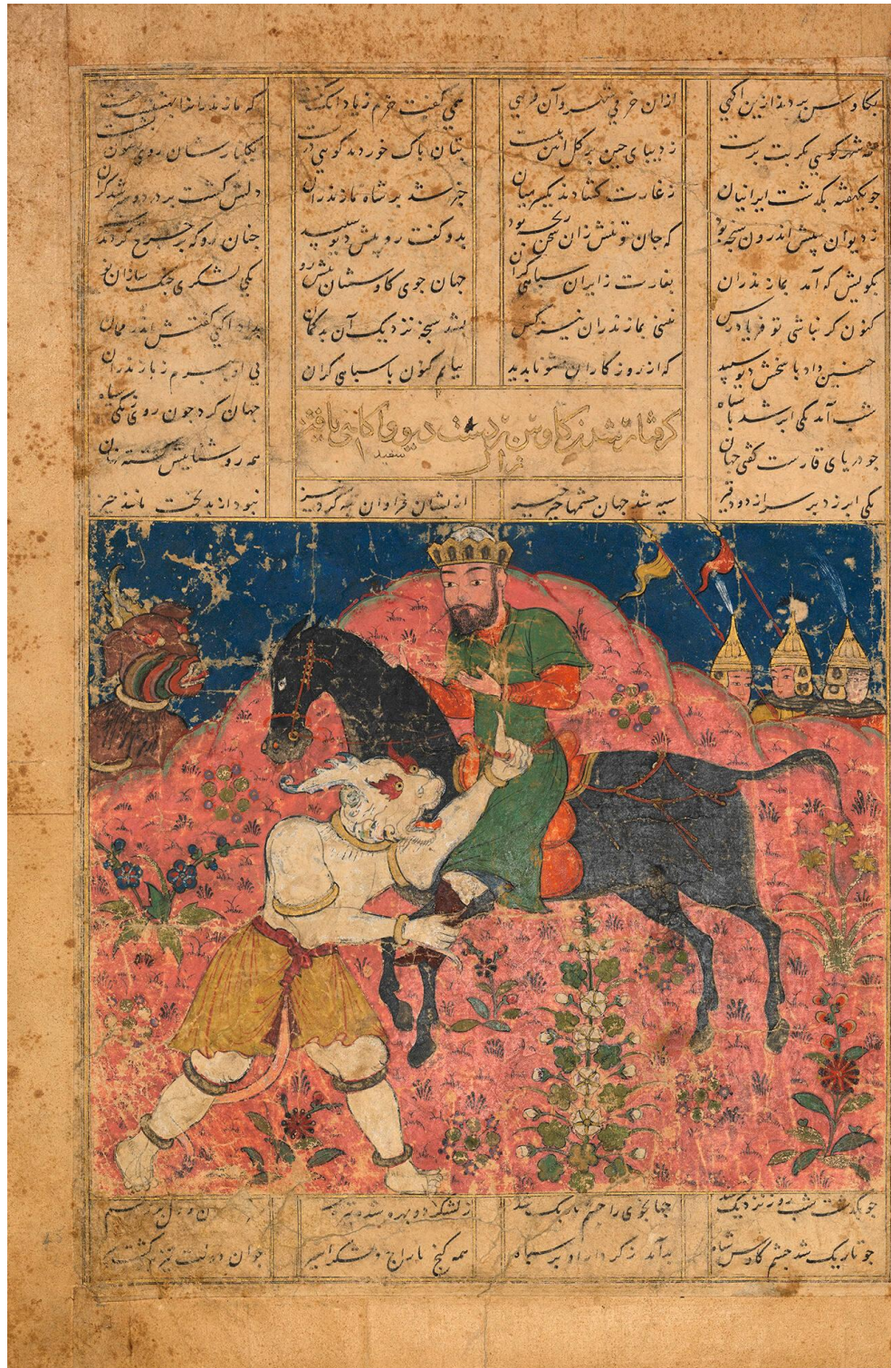
The fall of Mankind is symbolized within the context of Islamic mysticism by Kay Kavus, the second king of the Kayanian dynasty; in this miniature, Kay Kavus (son of the sublime Kay Kawad (or Kay Qubad), father of the misfortunate Siyavash (or Siyavush), and grandfather of

alteration of the earlier form of religion, rendering some narratives 'incredible' or 'inexplicable', due to the proliferation of the idiotic rationalism of the fallen humans. Then, the worthless believers accepted the 'unbelievable' stories blindly, further worsening their condition of grave faithlessness (without of course realizing the calamitous situation in which they found themselves).