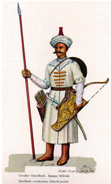
Drawing of a typical Qizilbash soldier

Then, what is fallaciously termed as "Safavid conversion of Iran to Shia Islam" describes in reality the mere rise of the Safavid Order in large parts of Western Asia and the effort to eliminate the monstrous, pseudo-Muslim theologians who want to rule on the basis of their false Sharia, and of their pernicious interpretations of the sacred texts. Not one Safavid Emperor called himself a "Shia" and not one Ottoman Sultan used this term for the Safavid rulers, with whom the Ottomans fought so many times, although they were all Turanians. About: