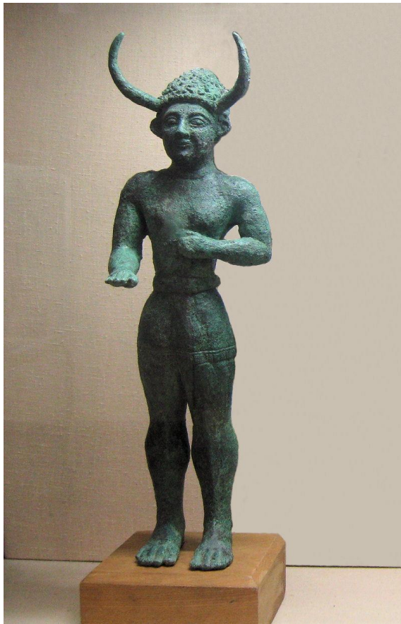
Statue of Baal (12th c. BCE) unearthed in Enkomi, Famagusta; to deny the Semitic-Canaanite identity of the island, the biased archaeologists did not name the statue correctly, but gave it rather an exotic appellation, namely 'horned god'!

The History of Cyprus has been extensively tampered with by prepaid pseudo-scholars, bogus-academics, and clownish professors who were on the payroll of London-based Greek ship owners, who were ordered by the Apostate Freemasonic lodge of England to monstrously disfigure the historical realities and to shamelessly portray Alashiya's History as "Greek". This fallacy would exacerbate the vicious political myths that were diffused by idiotic politicians and treacherous statesmen in Greece, who -thinking that they would 'unite Cyprus with Greece-' brought disaster, bloodshed and interminable conflict. These were the stupid victims of the English colonial liars and crooks who did not give a damn for the lives of the Cypriots, the Turks, and the Greeks.