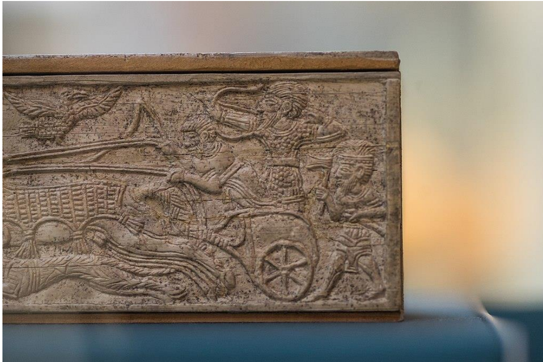
Ivory game board (detail) found at Enkomi, Famagusta; evident imitation of the Assyrian royal art by the artists of the local king who is depicted in hunting.