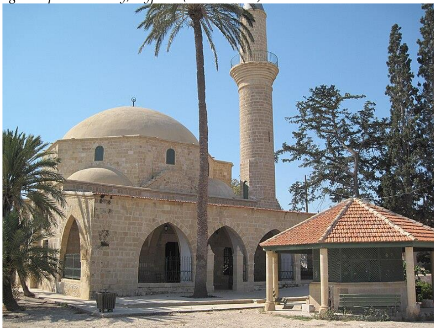
Hala Sultan Tekke (or Mosque of Umm Haram), Larnaca (16th-18th c.)