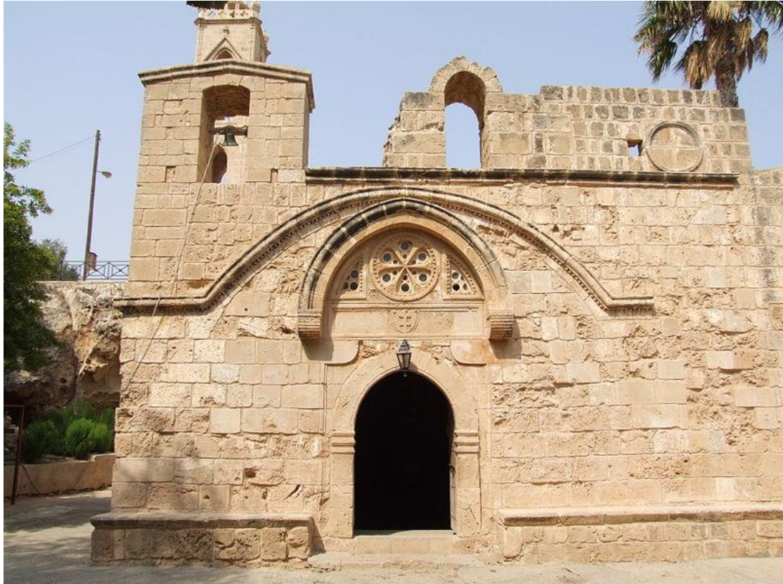
Agia Napa monastery, Cyprus (12th-18th c.)

and Umayyad condominium (688), The Eastern Roman Reconquista (965 CE) took an end with the Crusades (1191), the much loathed (by the Cypriots) Knights Templar, the Lusignan rule (1192-1489), and the Venetian rule that lasted until the Ottoman conquest (1571). The few Ottoman settlers were military officers who entered into mixed marriages, thus having no major impact on the ethnic composition of the local population.