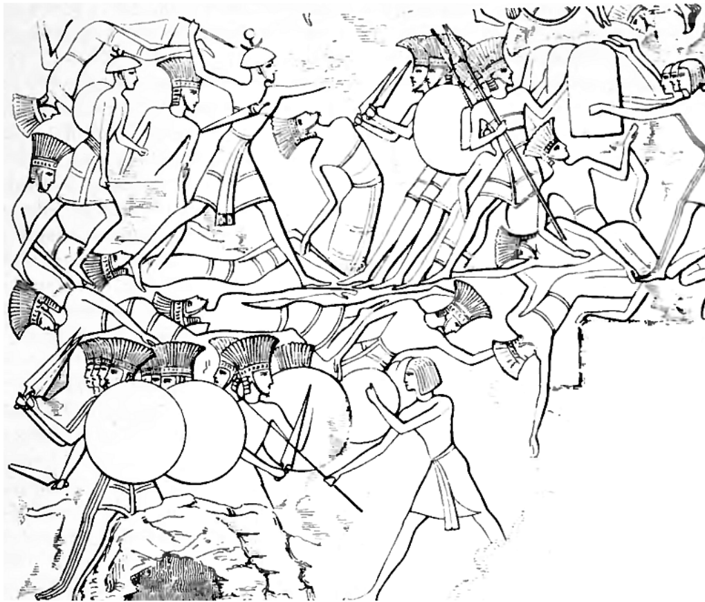
Tjekker (Teuceri) and Peleset (Philistines-Palestinians) fighting against the Egyptians and Pharaoh Ramesses III at the Battle of Djahy (ca. 1178 BCE); from the reliefs of the walls of the mortuary temple of Ramesses III at Medinet Habu, Luxor West

Bronze Age collapse' as a major historical circumstance; it is a marginal phenomenon that concerns peripheral lands to Mesopotamia.