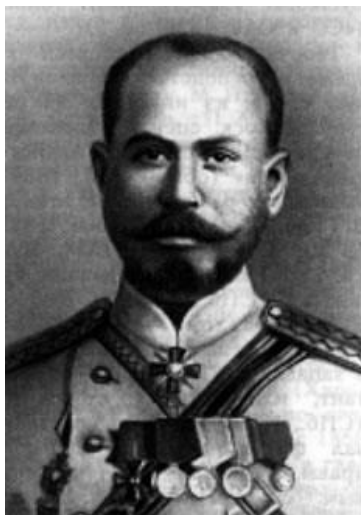
Alexander Ksaverievich Bulatovich

There are indeed many historical sources documenting the evil intentions of the Amhara and Tigray anti-Sudanese and anti-Egyptian racists. They date back to the pre-colonial times, when the tiny, pseudo-Christian, barbarian Amhara kingdom developed the unprecedented hatred under the form of eschatological wishes and apocalyptic dreams of destruction that would befall on the Egyptians and the Sudanese. Many foreign authors, explorers, commentators and historians took note of the evil dreams that are harbored in the sick, heinous minds of the Abyssinians.