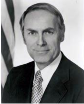
Druie Doug Barnard

One tiny example is offered by the Georgia Guidestones that stood from 1980 to 2022 {unveiled by US congressman Druie Doug Barnard (1922-2018) on 22nd March 1980} in Elberton (Elbert County, Georgia). It would be naïve to believe that the target of world population reduction to 500 million people involves Chinese, Indians, Africans and Latin Americans. Eugenics has been exclusively a Western European pseudo-science. About: https://en.wikipedia.org/wiki/Georgia_Guidestones#Inscriptions