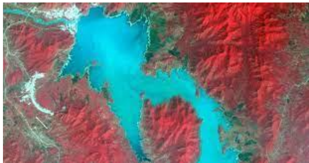
The Blue Nile River is seen as the Grand Ethiopian Renaissance Dam reservoir fills near the Ethiopia-Sudan border, in this broad spectral image taken November 6, 2020.