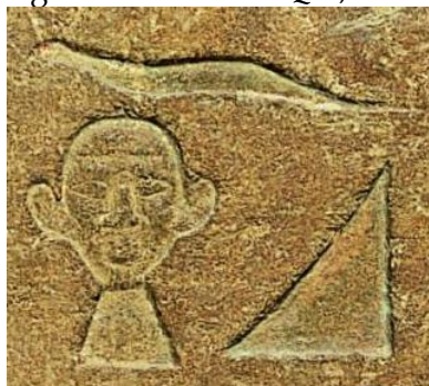
2300 BCE Barack Obama's first incarnation!

When the sick madman Barack Obama visited Egypt on the 4th June 2009, he was escorted to the pyramids by the then Secretary General of Antiquities Zahi Hawass; there, the enemy of the Ancient Egyptian spiritual heritage Barack Obama was well prepared and fully instructed as to what to comment when seeing an hieroglyphic sign in the tomb of Qar; he said that the sign "looked like him".